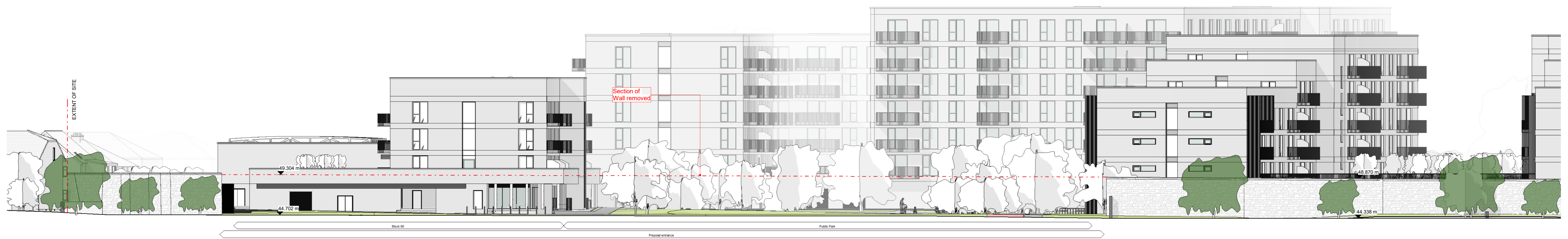
Site Entrance Section - Rosemount Green External (Proposed) 1:200